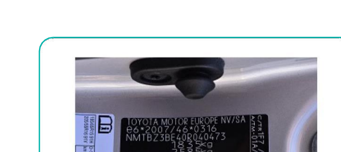
Photo of the car's VIN code. The usual locations of the VIN code are on the windshield, on the door or under the driver's seat.

Photo of the vehicle windscreen. Large-scale photo of the windscreen of the vehicle as close as possible so that all sides and corners of the glass would be visible in the photo.